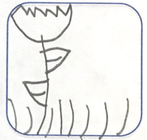
The Worms Eye View

(aka, Camera Inferior) Used to make things appear bigger than ordinary