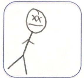
The High Angle Shot

Used to make the subject look strong and powerful