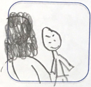
The Over the Shoulder Shot

Used to create empathy unless the camera is "creeping up on them"