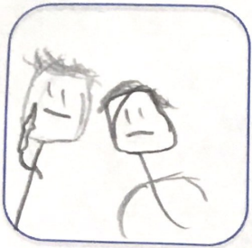
The Point of View

Used to show what character is seeing and give audience their perspective