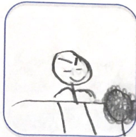
The Low Angle Shot ↗

Used to make the subject look strong and powerful